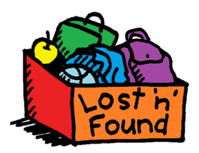
Your stuff misses YOU too.

In Fr. Lacey Hall, the items which were in our lost and found box are laid out on a table. If you have left something behind at St. Matthias, please check the table. All items still remaining on June 30th will be donated.