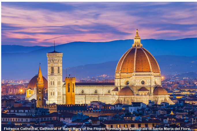
Florence Cathedral, Cathedral of Saint Mary of the Flower, formally the Cattedrale di Santa Maria del Fiore