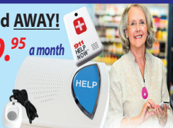
This Button SAVES Lives! As Shown GPS, Lowest Price Guaranteed!