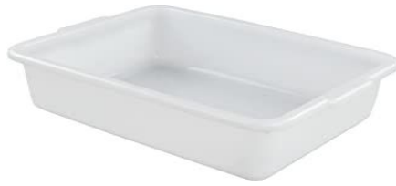
Morcte 3-Pack Commercial Bus Box, Plastic Bus Tub/Wash Basin, White

Additional bins will also be used for children to place their used toys so their Teacher can disinfect before returning it to the classroom environment.