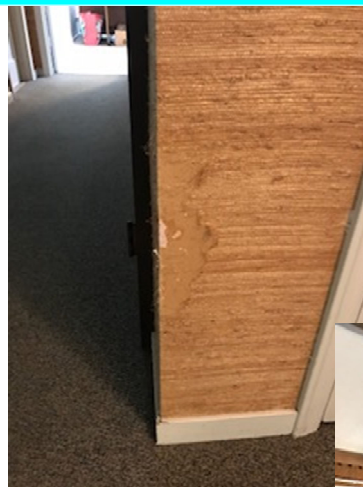
A example of the 60 year old, damaged wallpaper.