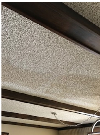
Water stained ceiling in the dining room

Currently, we are working with a couple of parishioners and a professional painter to update some of the rooms of the Rectory to remove 60 year old wallpaper, paint the interior, and improve the lighting in the dining room, conference room, living room and priest office space so that the rooms will be more inviting for meetings and events.