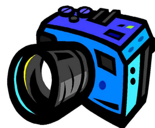
Photo & Announcement Deadline

All of us must be aware of such sensitive matters in the intimate life of the Christian community and we should expect that some will refrain from the sign of peace and the communal chalice out of care for our well being and not out of unkindness or lack of piety.