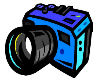
Photo & Announcement Deadline

Announcements and photos for the St. Matthias bulletin must be submitted by Monday at 10:00 am for the following Sunday's bulletin.