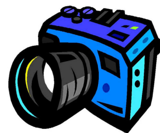
Photo & Announcement Deadline

Announcements and photos for the St. Matthias bulletin must be submitted by Monday at 10:00 am for the following Sunday's bulletin.