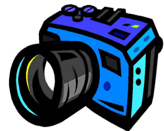
Photo & Announcement Deadline

Thank you to all who stopped by the tables last weekend to verify the information we have on file for your household. If you missed it, you can email us at info@stmatthiasparish.org . Please include the names of all those in your household, address, phone number and email address and any other notes you have for us. Thank you!