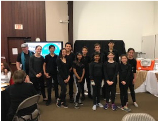
Photos from "Murder on a Movie Set" Murder Mystery Dinner & Silent Auction