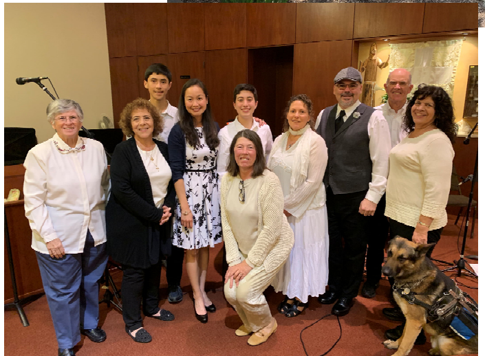
Our Easter Vigil musicians.