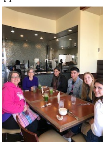
At Homeboy Café.