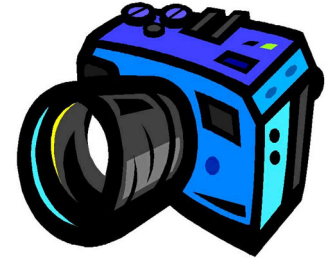
Photo & Announcement Deadline

We have received $45,593 or 68% of our assessment as of 10/31/2018.