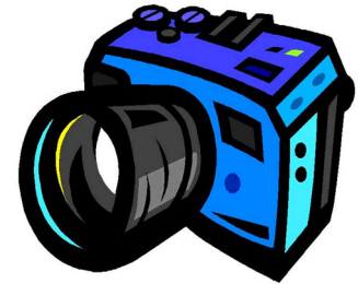
Photo & Announcement Deadline

We have received $44,477 or 66% of our assessment as of 9/26/2018.