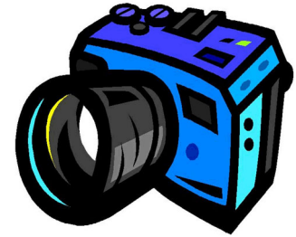
Photo & Announcement Deadline

Online giving is safe, secure and easy . Start giving online today! Visit our website at stmatthiasparish.org and click on "Support Us" then "Online Donation" to sign up.