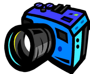
Photo & Announcement Deadline

We have received $33,943 or 50% of our assessment as of 8/14/2018.