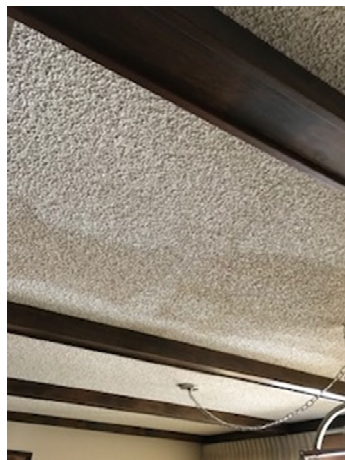
Water stained ceiling in the dining room

Currently, we are working with a couple of parishioners and a professional painter to update some of the rooms of the Rectory; to remove 60 year old wallpaper, paint the interior, and improve the lighting in the dining room, conference room, living room and priest office