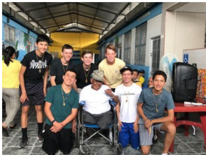
The boys following the Despedida.