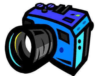
Photo & Announcement Deadline

All that is needed is a small FM pocket radio with headphone jack and earphones. Turn in to 88 on the FM dial.