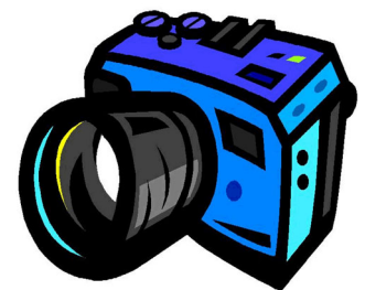
Photo & Announcement Deadline