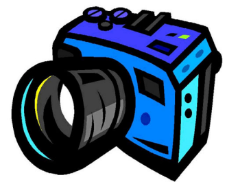
Photo & Announcement Deadline

All of us must be aware of such sensitive matters in the intimate life of the Christian community and we should expect that some will refrain from the sign of peace and the communal chalice out of care for our well being and not out of unkindness or lack of piety.