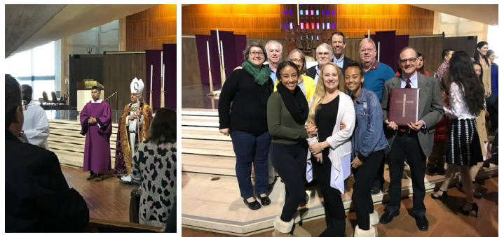
Archbishop Salvatore Cordileone