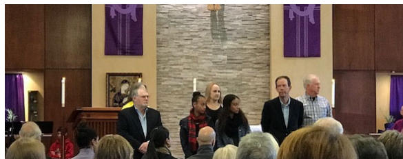
Rite of Sending at St. Matthias

Below are some photos from the celebrations