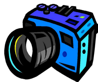
Photo & Announcement Deadline

All of us must be aware of such sensitive matters in the intimate life of the Christian community and we should expect that some will refrain from the sign of peace and the communal chalice out of care for our well being and not out of unkindness or lack of piety.