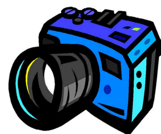
Photo & Announcement Deadline

All that is needed is a small FM pocket radio with headphone jack and earphones. Turn in to 88 on the FM dial.