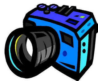
Photo & Announcement Deadline

Next weekend, October 28-29th we'll hold the regular fifth Sunday collection for St. Vincent de Paul .