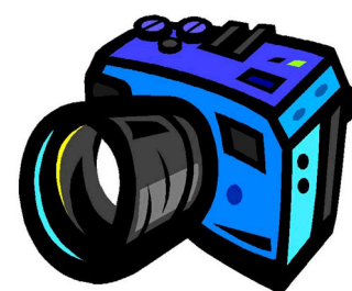
Photo & Announcement Deadline

Jackets, umbrellas, and glasses, oh my! Our Lost and Found box is overflowing with items. Please come by the Hall to see if you've misplaced anything.