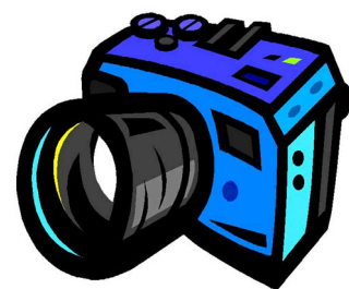
Photo & Announcement Deadline

Jackets, umbrellas, and glasses, oh my! Our Lost and Found box is overflowing with items. Please come by the Hall to see if you've misplaced anything.