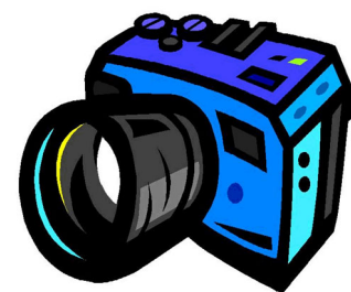
Photo & Announcement Deadline

In honor of our preschool's 40th anniversary, we are taking up a special second collection this week-end. For 40 years the preschool has served families in Redwood City, San Carlos and beyond, by providing a quality early childhood education. Many of our St. Matthias parishioners attended the preschool and many have children in attendance now. Please give generously to support the preschool!