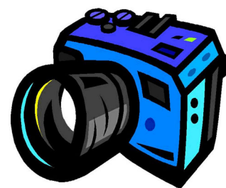
Photo & Announcement Deadline

Thank you for your generous support of our St. Matthias Preschool both in the special collection ($1,233 was received) and at the 40th Anniversary dinner. Your support helps to ensure that the preschool can continue to support the educational and developmental needs of our youngest members.